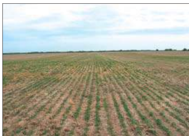
Figure 25. Emergence of glyphosate-tolerant canola direct-seeded into tall fescue sprayed in the spring.

Direct seeding glyphosate-tolerant canola into sprayed-out stands has worked very well as in-crop applications of glyphosate can control volunteer tall fescue and perennial weeds that may be present (Figure 26). Oats has also been shown to be a good crop to grow when direct seeded into sprayed out forage stands.