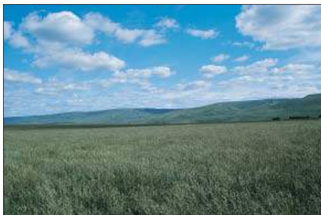
Figure 21. Tall fescue seed field in the Peace River Region of Alberta.

Generally, grasses require about 30 days from flowering to seed maturity (Figures 21 and 22). This period varies because flowering and seed development can last from several days to two weeks, resulting in seed heads emerging at different times and not ripening uniformly. Hot, dry weather reduces ripening time, and cool, moist conditions delay seed maturity.