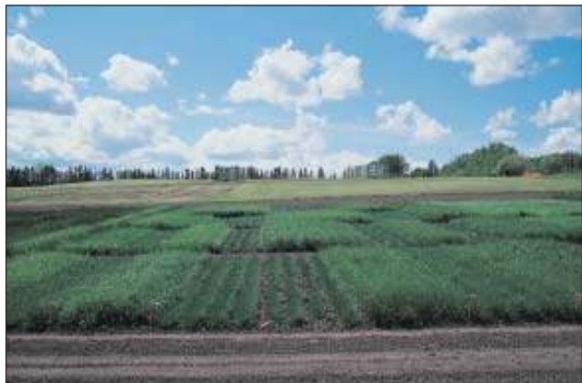
Figure 8. Tall fescue variety seed yield evaluation trial at Beaverlodge, AB.

The Western Canadian Grass Seed Testing program, an industry-sponsored testing program, can be a source of yield information for some tall fescue varieties. The latest information can be accessed from the web at http://www1.agric.gov.ab.ca/$department/deptdocs.nsf/all/crop9397