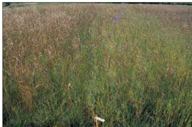
Figure 14. Effect of wild oat competition on seedling tall fescue the year after establishment.