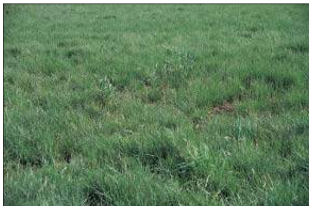
Figure 9. There is zero tolerance to quackgrass seed contamination in tall fescue seed.

Seed of other weeds such as foxtail barley, Canada thistle, perennial sow-thistle, Persian darnel, annual bluegrass, rough bluegrass, fowl bluegrass, downy brome and volunteer grasses are difficult to remove by cleaning. Applying glyphosate pre-harvest or post-harvest in annual cropping rotations for several years before seeding tall fescue can minimize most perennial weed problems. Even moderately weed-infested fields should not be used for establishing tall fescue for seed. Hand roguing or spot spraying of problem grasses will be required to meet quality standards.