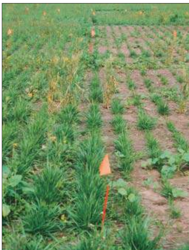
Figure 13. Sensitivity of seedling tall fescue to grassy weed herbicides.

** Number of trial sites included in the average % yield. Trials conducted at Edmonton, Beaverlodge and Rycroft, AB, Baldonnel, BC, Outlook, SK, and Arborg, MB, from 1998 to 2002.