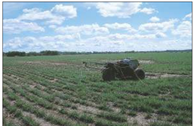
Figure 15. Modified ATV used for spot spraying in tall fescue seed fields.

Table 11 lists the herbicides currently registered for use on established tall fescue, the herbicides causing no injury to moderate injury and the herbicides causing severe injury to established tall fescue in research trials, usually applied in the spring before the shot blade stage. Only herbicides that are registered for use on tall fescue can be recommended.