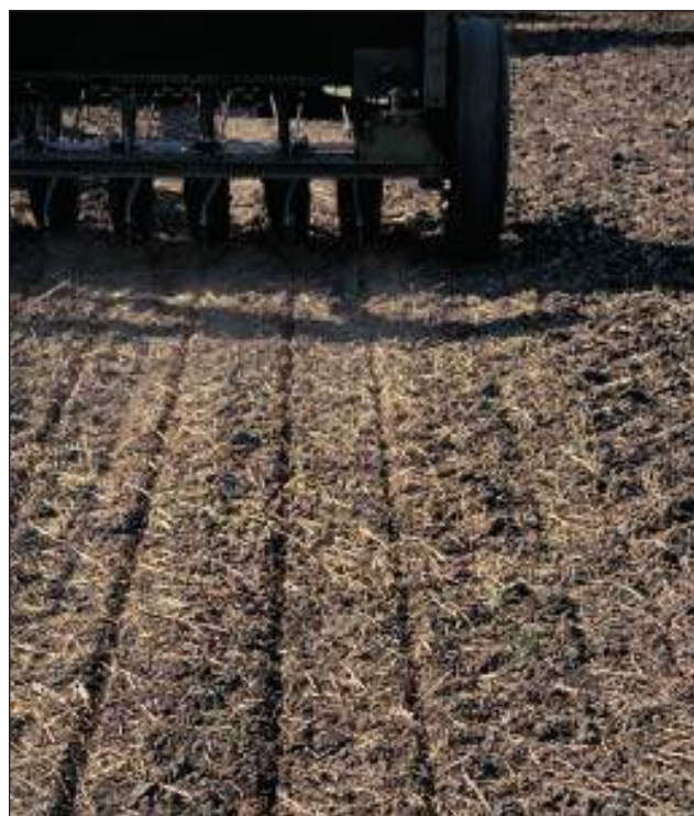
Figure 10. Seeding tall fescue into a firm, tilled seedbed.

Seedbed preparation in the previous fall or very early in the spring promotes the germination of some weed seeds and reduces soil moisture losses from excessive cultivation. Tall fescue can be seeded one to two weeks after the last spring cultivation and sprayed with a glyphosate product before seedling emergence (Figure 10).