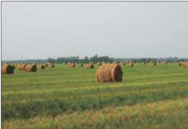
Figure 23. Tall fescue straw can have good feed quality.

A subsequent benefit of growing tall fescue seed crops is that seed producers can make use of the straw for livestock feed and possibly fall regrowth for grazing (Figure 23). However, producers must be aware that the endophyte Neotyphodium coenophialum may be present in tall fescue turf varieties (and the older forage-types), and it is important that they understand the effects that endophytes can have on livestock when utilizing straw, fall regrowth and especially seed screenings (see below). Endophyte-infected varieties of tall fescue are currently being developed that do not cause toxicity problems when fed to livestock.