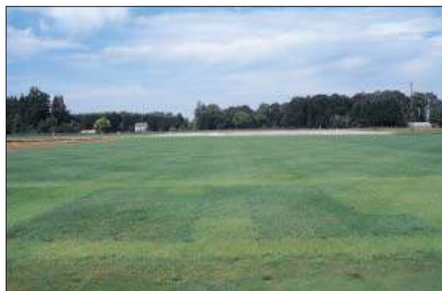
Figure 2. Tall fescue turf variety evaluation trial.

conditions or under irrigation, yields have ranged from 700 to 1,500 kg ha -1 and under minimal moisture from 200 to 900 kg ha -1 . Generally, seed fields are kept in production for two to four years