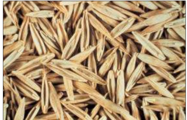
Figure 7. Tall fescue seed.

The price received by the grower for tall fescue seed (Figure 7) is determined by the variety contracted and the quality of the seed produced. Quality is evaluated in terms of weed seed contamination, germination and purity. Specific weed seeds can cause problems depending on the destination and end use of the final product.