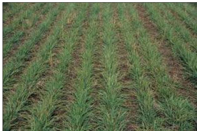
Figure 12. Tall fescue seeded in rows generally results in higher seed yields than broadcast seeding.

In the Peace River Region, research indicates seed yield can be optimized for at least 3 consecutive years by establishing an initial density of 20 to 100 plants m -2 in rows 20 to 60 cm apart. If maximizing first-year seed yield is a priority, the initial establishment should be a density of 25 to 50 plants m -2 in rows 20 to 40 cm apart.