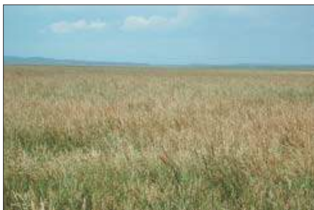
Figure 22. Irrigated tall fescue seed field in southern Alberta.

The tall fescue crop will be ready to swath anywhere from late July to early August. The seed heads will be brown at the top with a tinge of green, and 5 to 15 per cent of the seeds will be immature. Seeds will be in the hard-dough stage. Tall fescue is generally swathed as the risk of shattering is quite high, as the crop can lose 2 to 3 per cent moisture per day under good weather conditions.