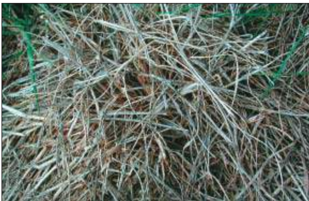
Figure 4. Winter injury on tall fescue plant.

Tall fescue has moderate winter hardiness (Figures 4 and 5). Winterkill may occur when winter onset is rapid and plants haven't started going dormant, during periods of drought, when snow cover is insufficient or when plant dormancy is broken too early. Although tall fescue does well under moist conditions, it is only moderately drought tolerant. It grows better in open, sunny locations.