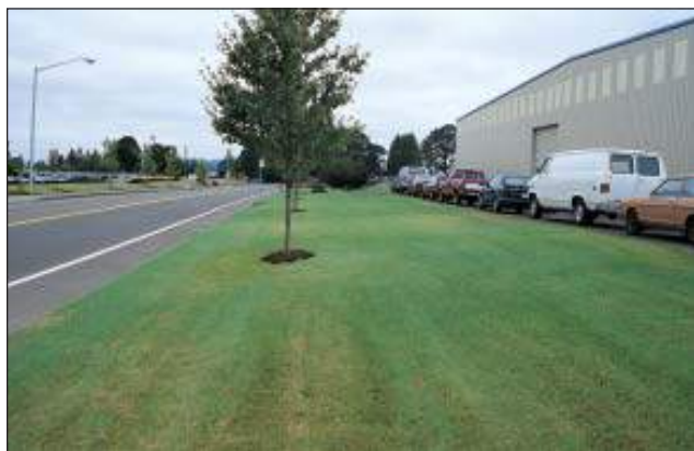
Figure 1. Tall fescue used in an urban setting.

Before the early 1980s, tall fescue varieties were developed mainly for forage production, but since that time, more turf-type varieties have been developed for recreational uses.