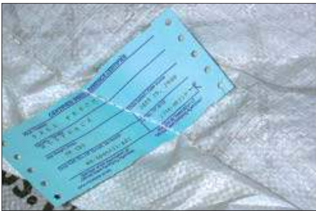
Figure 6. Tall fescue seed bag label.

If the seed does not meet the standards as outlined, the price to the producer will be substantially reduced. Seed produced under contract is generally grown for certified production. Production contracts help ensure the producer's profit potential, but it is very important for producers to fully understand the contract before signing.