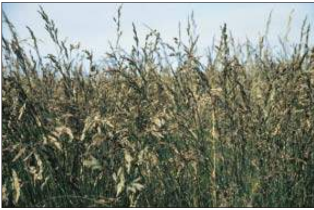
Figure 3. Tall fescue seed heads.

Tall fescue is cross-pollinated and self-incompatible, and it will readily cross with species such as meadow fescue and perennial ryegrass.