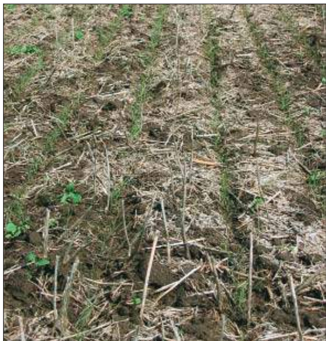
Figure 11. Direct seeding tall fescue into canola stubble is an excellent method of stand establishment.

Soil tests should be conducted to determine nutrient requirements for fertilizers that can be applied before or at seeding. If phosphorus and potassium are required, apply a sufficient amount before seeding to provide adequate nutrients to last the expected life of the stand. Once the stand is well established and weeds have been controlled, nitrogen may be applied to increase the development of tall fescue seedlings.