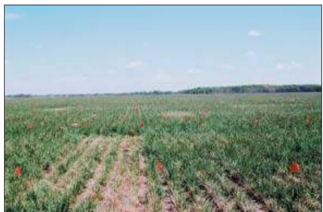
Figure 16. Wild oat herbicide damage on established tall fescue.