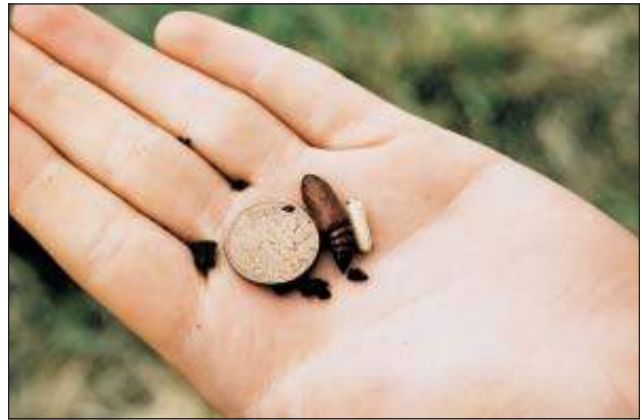
Figure 19. Glassy cutworm pupae.