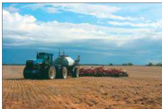
Figure 24. Direct seeding an annual crop into a tall fescue stand sprayed out the previous fall.

Most cereal, oilseed and pulse crops can be direct seeded into sprayed-out tall fescue stands. The annual crop selected will depend on seedbed conditions, potential soil herbicide residues and in-crop herbicide options.