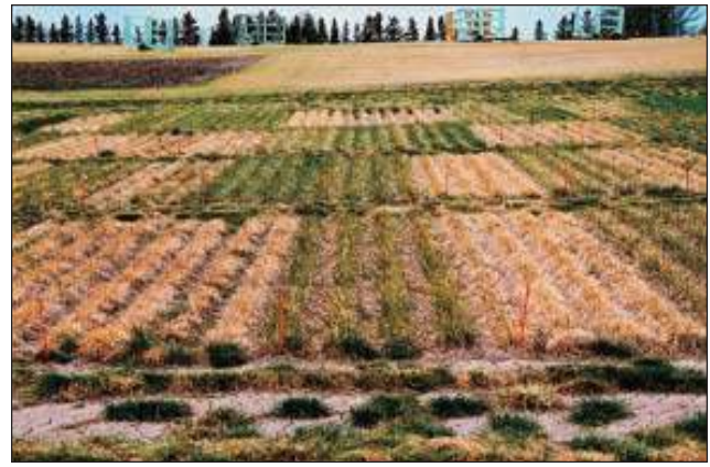
Figure 5. Winter hardiness differences in tall fescue varieties.

Tall fescue is adapted to a wide range of soils, but does best on heavy soils or moist medium-to-heavy textured soils. It tolerates soil pH ranging from 4.5 to 8.0 and has one of the widest ranges of soil reaction tolerance of the commonly grown grass species. Alkalinity tolerance is moderate, while acidity and salinity tolerance is high.