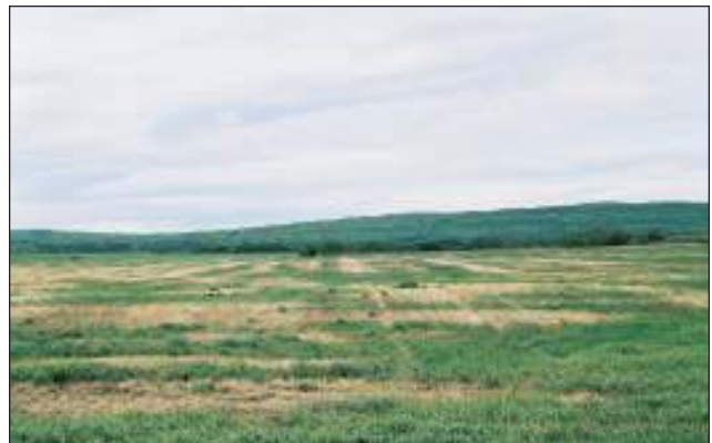
Figure 20. Grass seed field damaged by glassy cutworm.